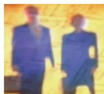
13,400 publically held corporations

70% – sole proprietors 20% – private corporations 10% – partnerships