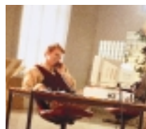
20 million small to mid-size businesses